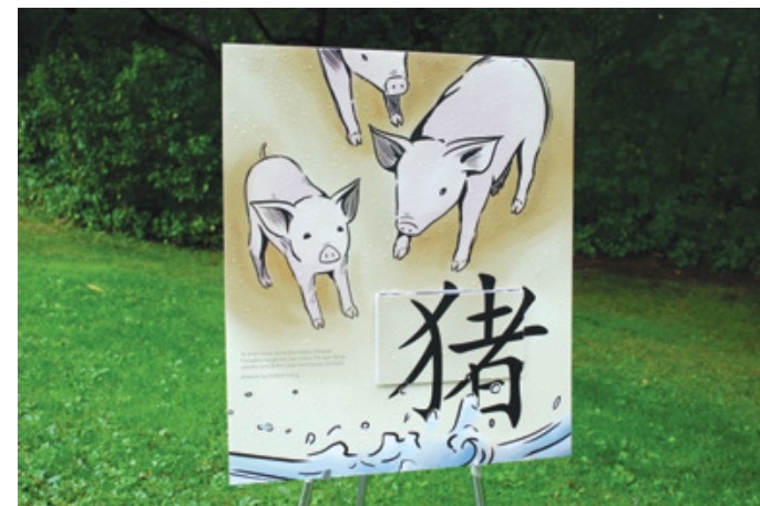
(left) UBC student Debbie Liang's interactive exhibit panel.