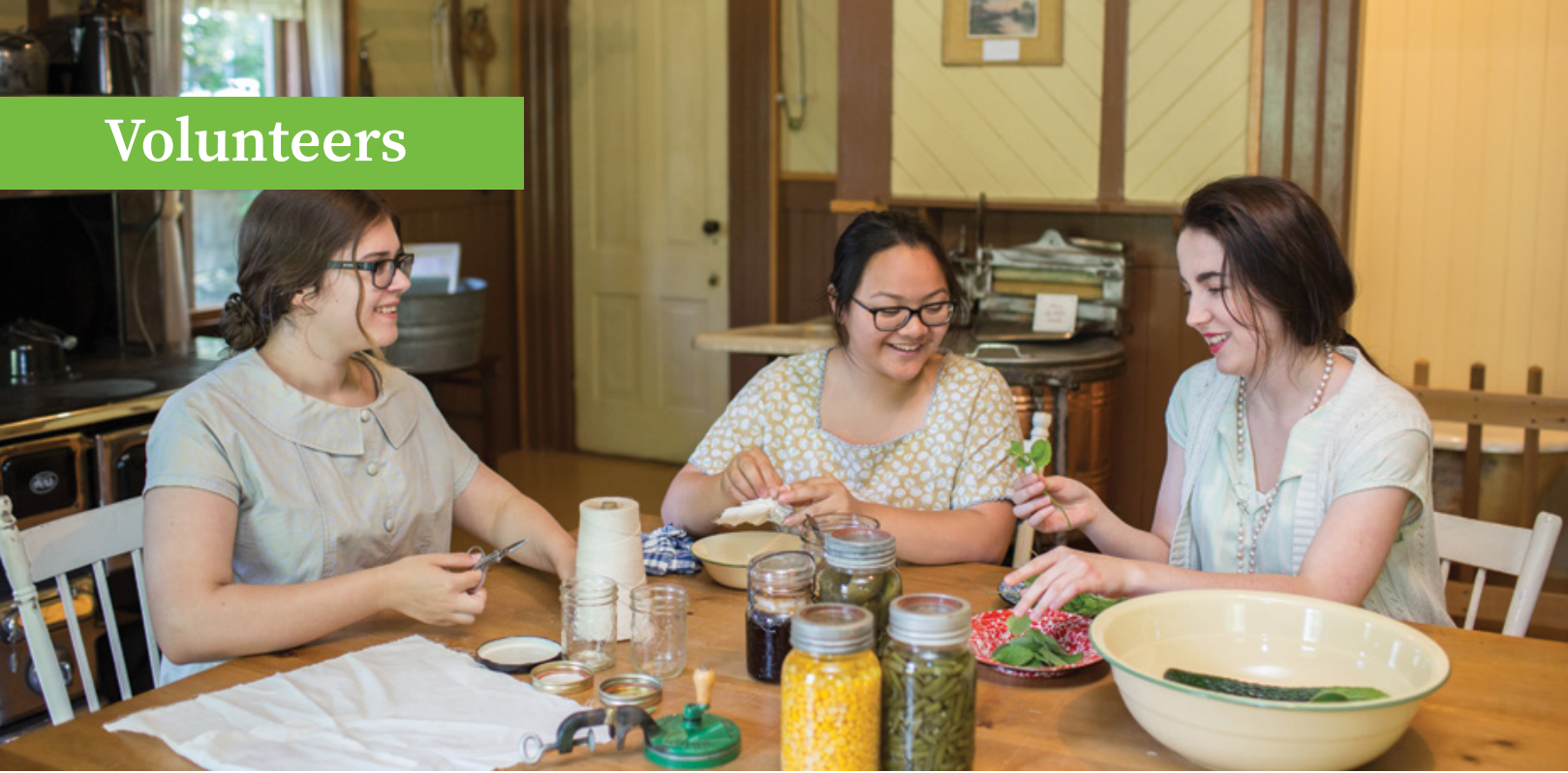
Village Volunteers, pickling demonstration at Love Farmhouse.