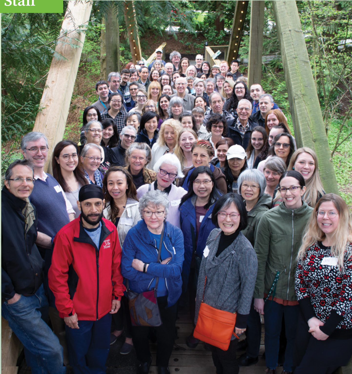
Burnaby Village Museum Staff and Volunteers