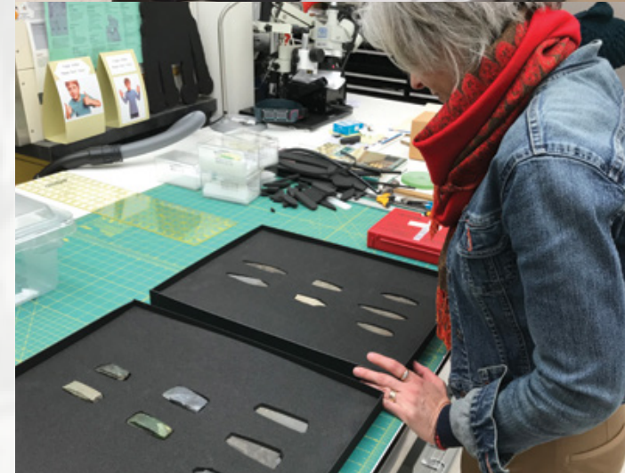
(top left) Conservation detail photography of BV998.571. (bottom left) First Nations belongings in new service supports.