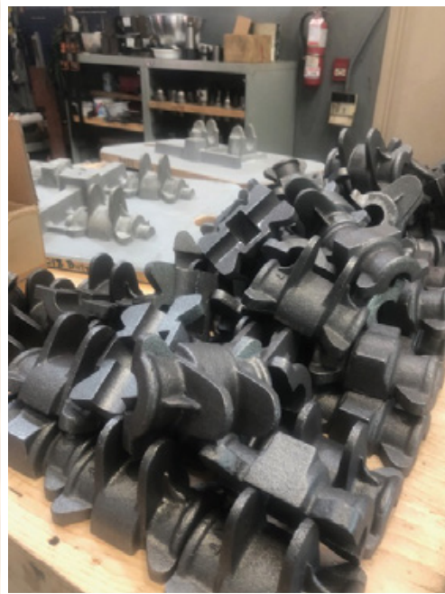
(left) New carousel bearings, castings, and forms. (right) Original carousel eccentric rod bearing, in situ.

One of the most appreciated artifacts in the museum's collection, the 1912 C.W. Parker Carousel also operates to maximum capacity as a public ride. Keeping riders safe is the top priority in carousel operation. In 2019 we commissioned the fabrication of high quality, high strength replacement gears and bearings for the carousel drive train. These components take the power of the main gear on the center pole, across the upper beams to move the horses up and down. The new parts look and work the same but without the loose tolerances of the worn original parts. Riders may notice their favourite horse now gives a better ride.