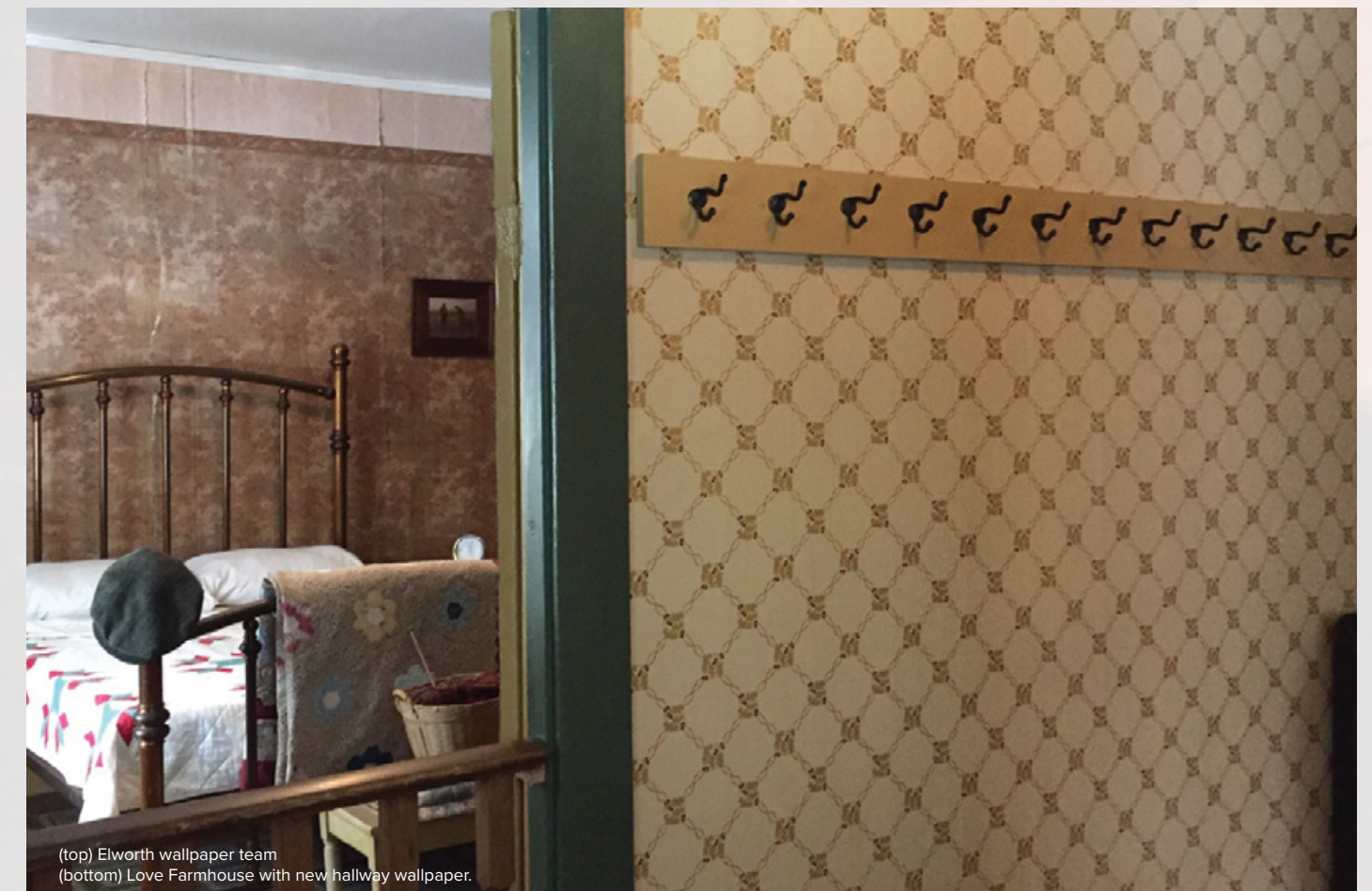
(top) Elworth wallpaper team (bottom) Love Farmhouse with new hallway wallpaper.