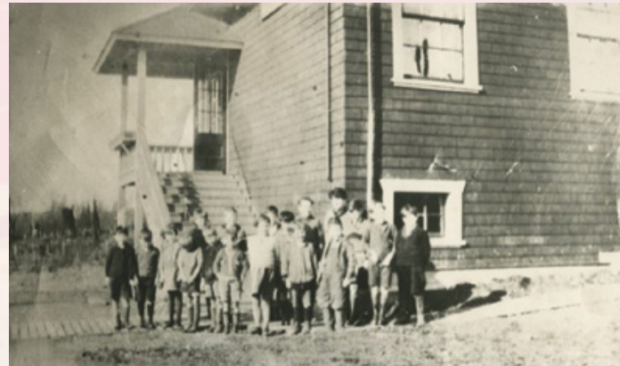
Students in front of Seaforth School at its original location on Government Road, c. 1925. This school is now on site at Burnaby Village Museum. BV985.6022.1