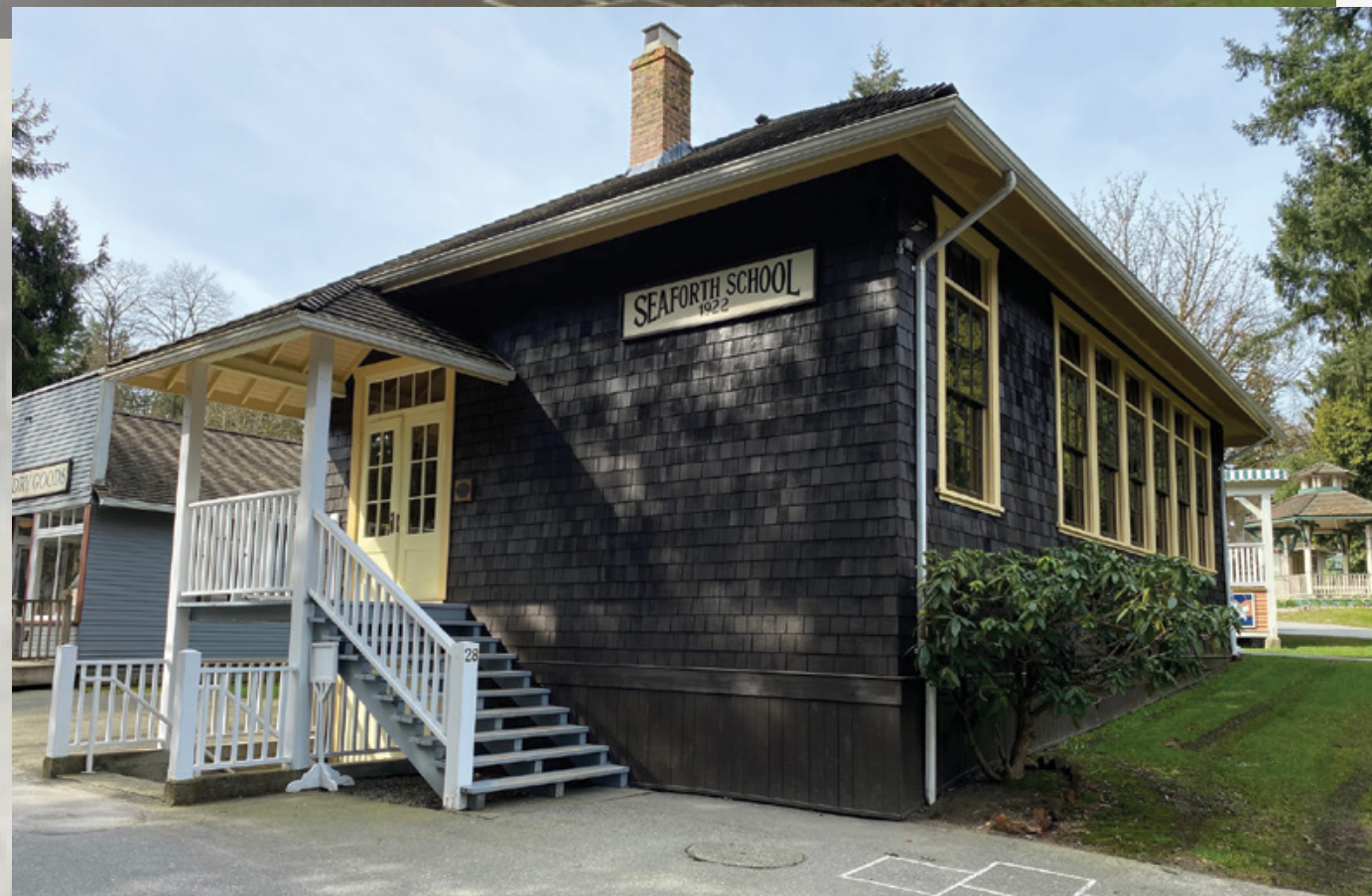
(top) Seaforth School before repainting. (bottom) Seaforth School after repainting.