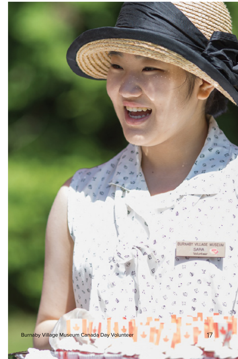
Burnaby Village Museum Canada Day Volunteer

Vancity Community Partnerships Grant Department of Canadian Heritage Real Estate Foundation of BC World Rivers Day Organization